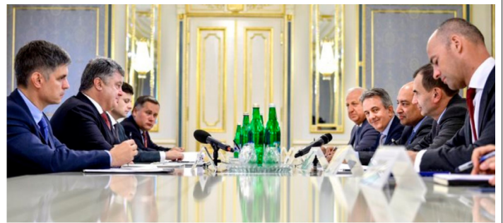
The EBRD delegation meets Ukraine’s President Poroshenko in Kiev.