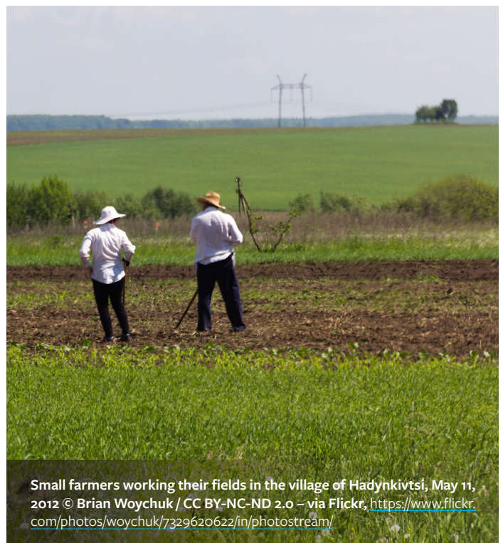
Small farmers working their fields in the village of Hadynkivtsi, May 11, 2012

The above can be the basis for the transformation of the agricultural sector in Ukraine to make it more democratic, environmentally, and socially sustainable, in a way that benefits the majority of the people – guaranteeing the right to “high-quality and safe domestically produced food.” 216 International policy and financial support should be geared towards this transformation, to benefit people and farmers rather than allowing colonization by oligarchs and foreign financial interests. 217