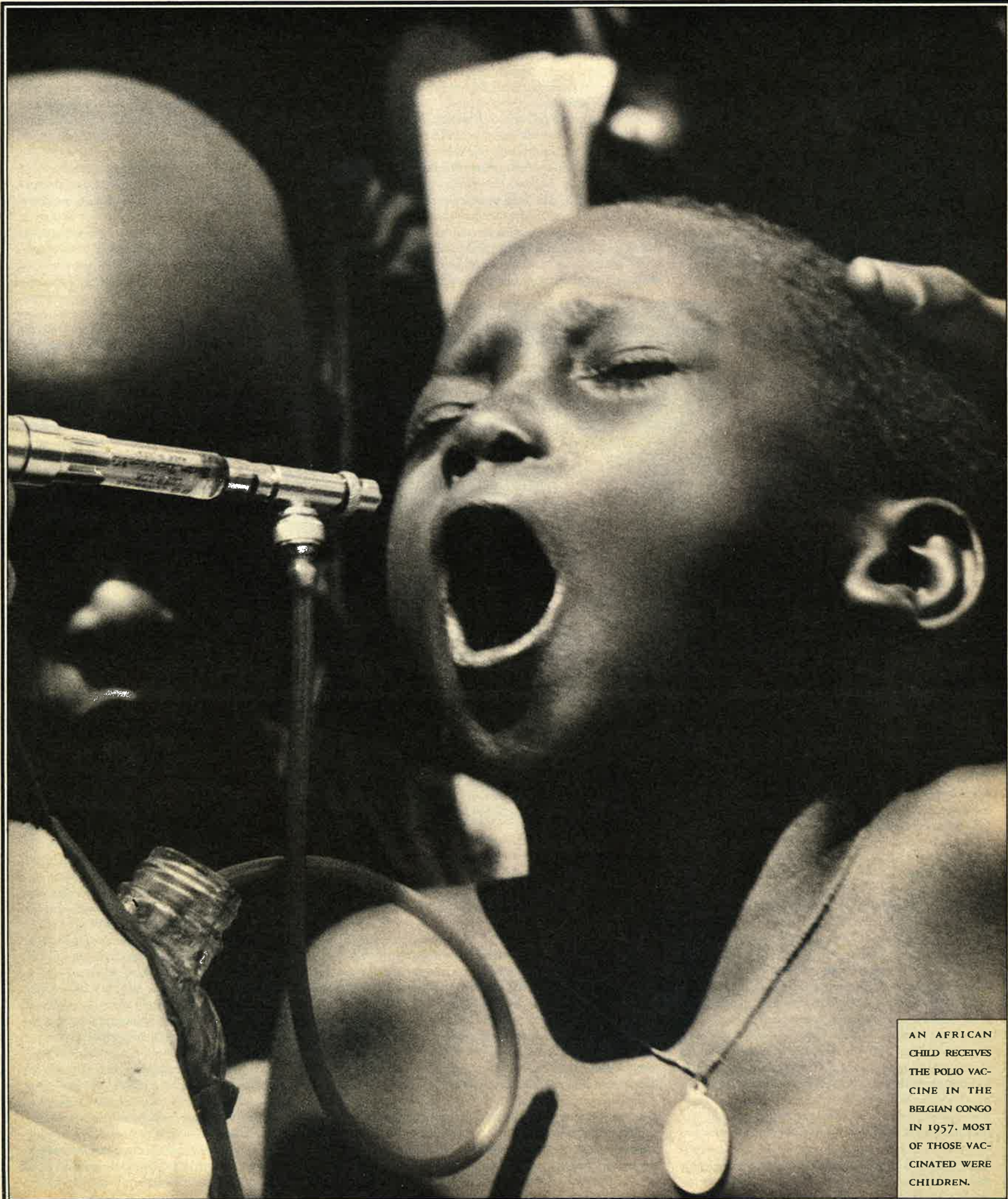
AN AFRICAN CHILD RECEIVES THE POLIO VACCINE IN THE BELGIAN CONGO IN 1957. MOST OF THOSE VACCINATED WERE CHILDREN.