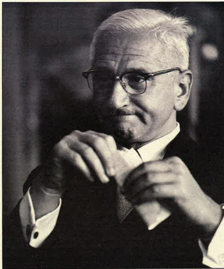
DR. ALBERT SABIN, WHOSE VACCINE HELPED ERADICATE POLIO, PICTURED IN 1962

Still, there are some troubling statistical associations. In 1968 a scientist in Australia described a correlation between polio immunization and cancers in children past one year of age. Much later, German scientists found ev-