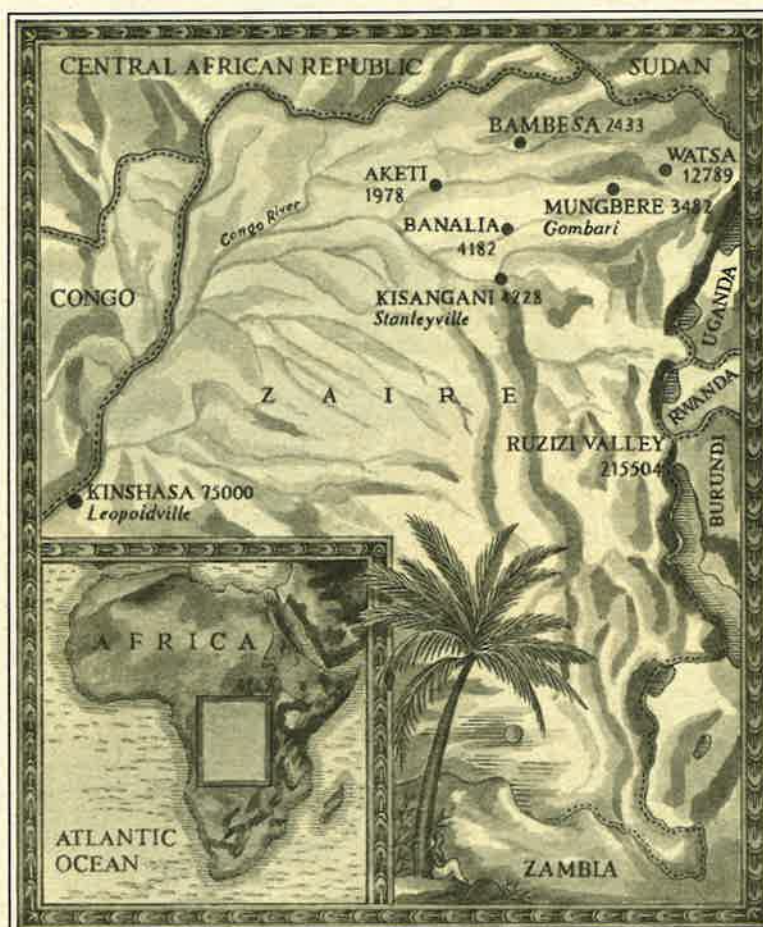
SITE OF MASS POLIO VACCINATION, 1957-1960: 325,000 KNOWN INOCULATIONS

In one of the greatest triumphs of twentieth-century medicine, the promise to deliver us from that crippling contagion was kept. The one-two punch of the "polio shots" developed by Dr.