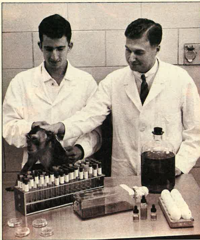
DR. HILARY KOPROWSKI AND AN ASSISTANT MAKING POLIO VACCINE IN 1956