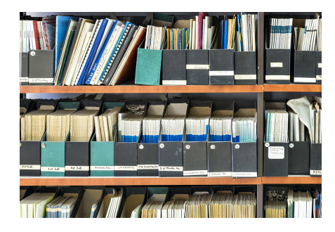
Don't forget ILSI's entire publication list is online: